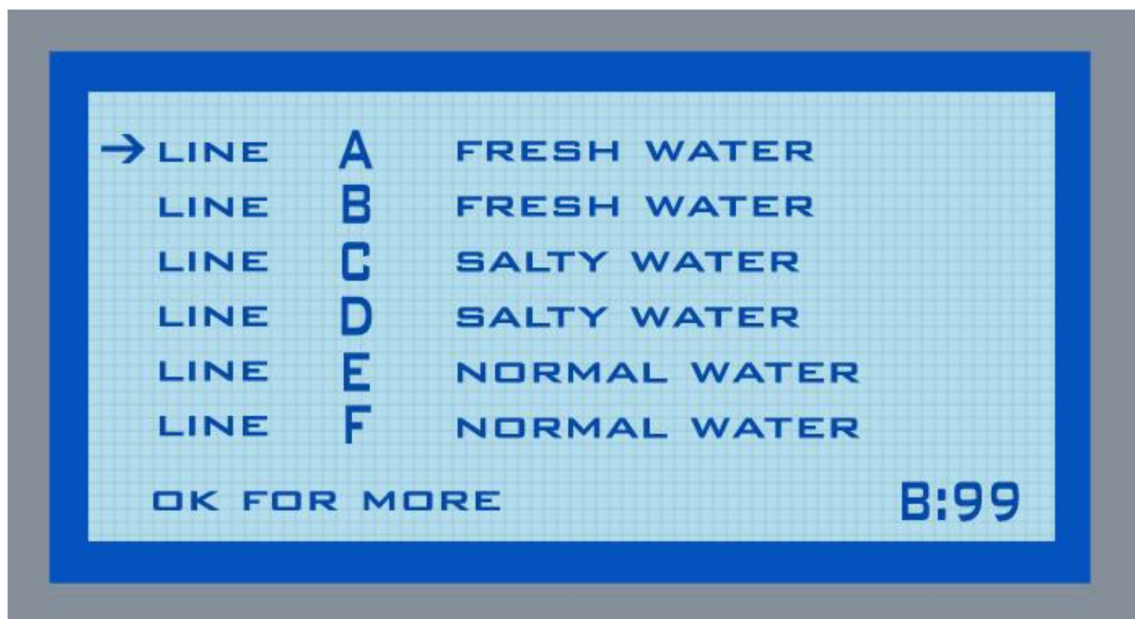
Fig.1 quality of ground water found by the device

The device shows the type of water (Fresh Water, Salty Water or Normal Water) It also shows depth of water in metres and the amount of water in percentage